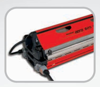
Aero® Press: An innovative, air-cooled press that does not require external components. Complete cycle time is approximately 10 minutes, significantly increasing belt productivity.