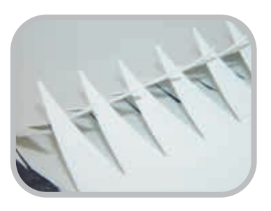
Punches precise fingers