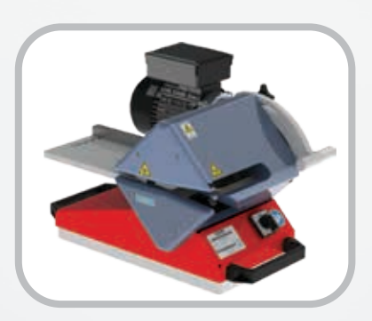
Ply 130™ Ply Separator: The robust design allows for quick, effortless, and precise ply separation on thermoplastic belts even extremely thin or difficult belts.