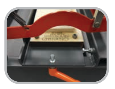
Easy positioning and clamping