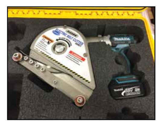
Step 3. Replace CEBC cutter.