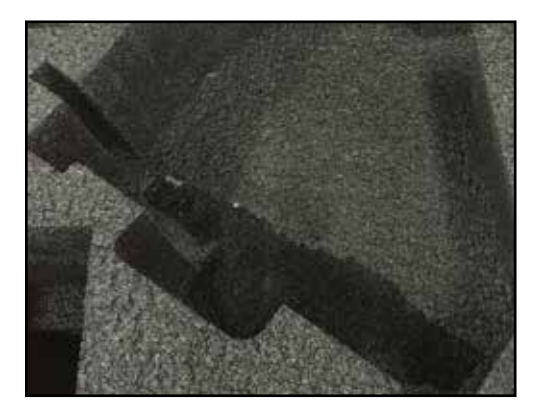
Step 1. Remove the cutter. You will see a "raised" foam insert member which the current rail system rests on. Remove that piece. There may be some light adhesive on the bottom of it which secures it in place.