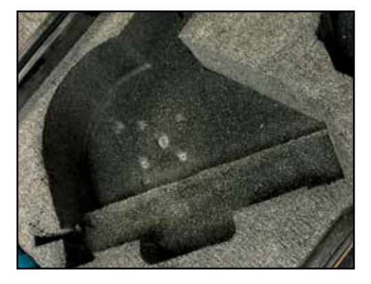
Step 3. Replace the modified foam insert back in its original place.