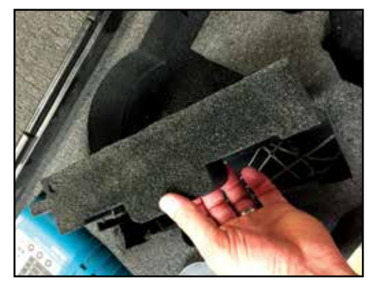
Step 1. Remove the cutter. You will see a "raised" foam insert member which the current rail system rests on. Remove that piece. There may be some light adhesive on the bottom of it which secures it in place.