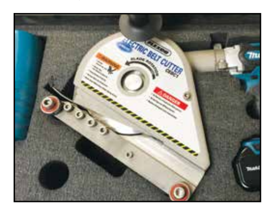
Step 4. Replace CEBC cutter.