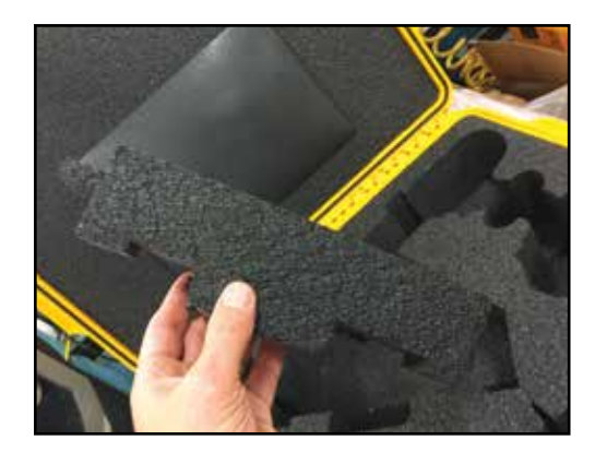
Step 2. Discard that piece. You will not need it any longer.