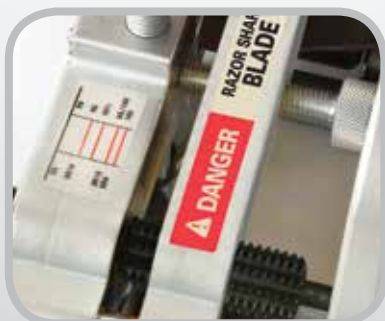
The FSK™ is offered with your choice of metal or plastic fence for adjusting the skive width. The metal fence is ideal for environments where consistent, repeat skive width is important.