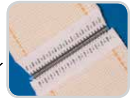
Fastener points are covered by the patch during installation