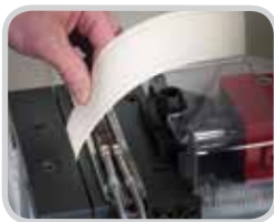
Built-in cooling station insures proper bonding of the patch material with the laundry tape