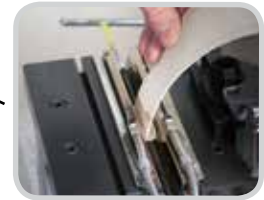
Heated jaws activate the glue during the quick installation process