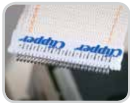
Custom patch logos available