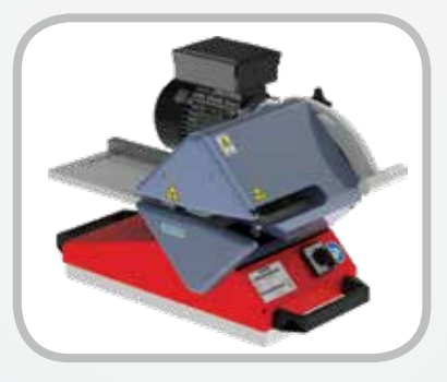
Ply 130<sup>™</sup> Ply Separator: The robust design allows for quick, effortless, and precise ply separation on thermoplastic belts even extremely thin or difficult belts.