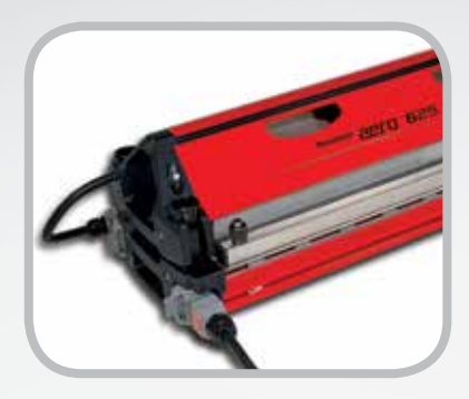
Aero® Press: An innovative, air-cooled press that does not require external components. Complete cycle time is approximately 10 minutes, significantly increasing belt productivity.