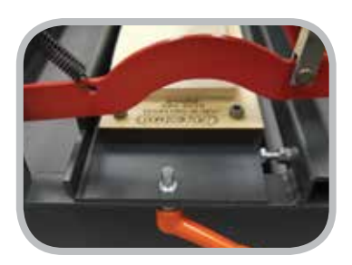
Easy positioning and clamping

Unit 7 Kingsmark Freeway • Oakenshaw • Bradford, BD12 7HW • United Kingdom Tel: +44-1274-600-942 • Fax: +44-1274-673-644 • Email: sales@flexco.co.uk