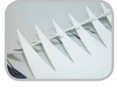
Punches precise fingers