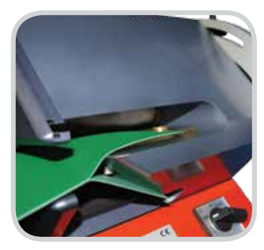
Separate between the plies

The Ply 130™ is used to separate between the plies of a conveyor belt. This cutting action is often required in preparation before splicing a belt with a splice press. A great advantage of this ply separator is that it can split as deep as 130 mm (5") in one action. This is especially helpful when splitting very thin belts or belts where the material is difficult to cut, like with thin polyurethane belts. The Ply 130 is an excellent tool for preparing stepped splices and for recessing mechanical fasteners.