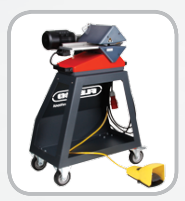
Optional Ply 130 Cart *optimal cutting height of 39" (960 mm)

The Ply Cart provides a convenient method of using the Ply 130 throughout the light-duty workshop. It is no longer necessary to custombuild carts or purchase utility carts, which are not optimal for ply separator transport. Previously-purchased Ply 130 units are easily mounted onto the cart using a retrofit tray.