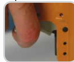
Single-Trigger Activation A single trigger pull sets rivets for quick and easy installation