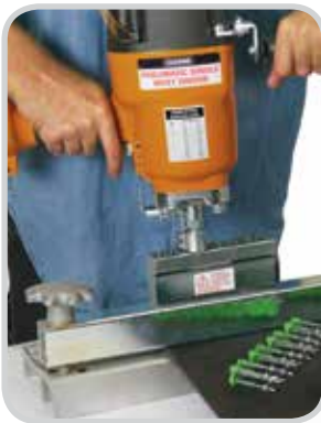
Dual Handles Provides an ergonomic grip and easy balance

Faster, more consistent rivet driving for heavy-duty rivet splices. The Pneumatic Single Rivet Driver, along with our Flexco® BR™ and SR™ fasteners and installation tools, speeds installation by up to 33%. A single trigger pull per rivet takes the guesswork out of rivet driving to give you a uniform long-lasting splice every time.