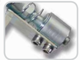
Nose Piece and Heavy-Duty Drive Rod For precise, consistent rivet driving