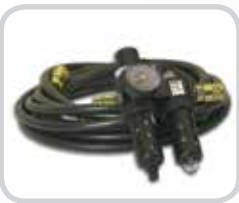
Pneumatic Driving Power Air powered for reduced operator fatigue and robust installation