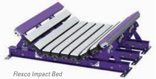
Flexco Impact Bed Medium Duty (EZIB-M)