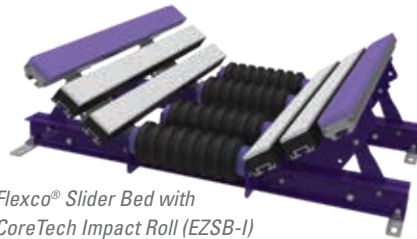
Flexco® Slider Bed with CoreTech Impact Roll (EZSB-I)