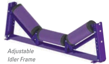
Adjustable Idler Frame