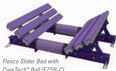
Flexco Slider Bed with CoreTech™ Roll (EZSB-C)