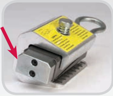
Large impact plate provides easy striking surface.