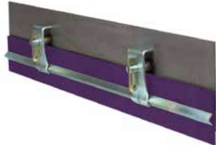
RMC1 Skirt Clamp (Standard)

*Includes two clamp plates (Standard or LS- Limited Space) two clamp pins, and one 1.2M (4') clamp bar. Skirt board and skirting not included. Skirting Thickness Ranges: 8mm to 19mm (5/16" to 3/4").