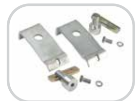
Bolt-On PAL PAK available when welding is not an option