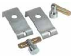
PAL PAK (Standard)