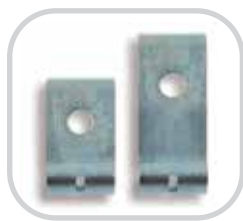
Optional limited space skirt clamps available

RMC1 Skirt Clamps provide the cost-effective solution to material spillage problems in your conveyor loading zones. A good material containment system at the loading point reduces conveyor problems and saves cleanup costs. It stops material loss, eliminates safety hazards and reduces wear and premature failure of conveyor components.