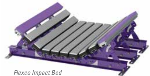
Flexco Impact Bed Medium Duty (EZIB-M)