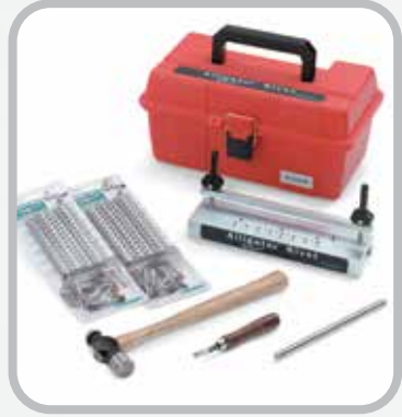
Portable Hand Applicator Tool Kit

Each kit includes Installation Tool, Belt Hand Skiver, 1 lb. hammer, Pin Bender, and 2 packages of Alligator Rivet, packaged in durable plastic tool box.