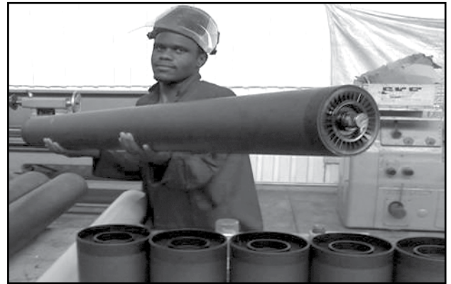
A roller made of lighter materials would require only one individual to lift, carry, and place the roller.

Weight is a safety issue when it comes to your workers. Workers injure themselves in several ways, including lifting cumbersome, heavy rollers. Traditionally, rollers have been constructed from steel; the heavier the application, the heavier the roller. For example, a single 1800 mm roller can weigh up to 45 kg., making the roller difficult to carry and install. And the longer the roll, the more concern arises about weight and the risk of back injury. Especially on incline conveyors or conveyors not accessible by maintenance vehicles, the weight of a roller can become a major drain on productivity and source of injury risk.