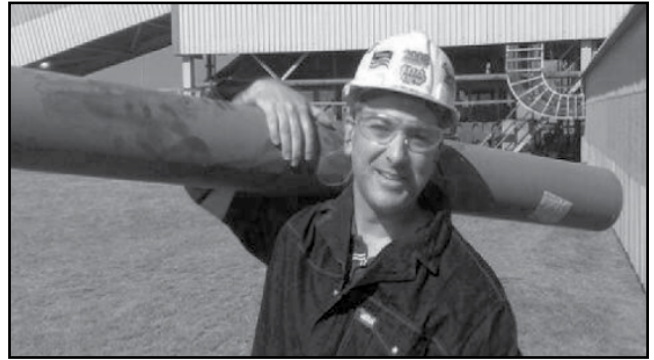
CoreTech™ rollers feature balanced, ultra light construction for safe, easy handling.

CoreTech rollers are approximately 40 percent lighter than equivalent steel rolls and as the rollers get longer in the larger diameter steel rolls, that weight reduction gets closer to 50 percent.