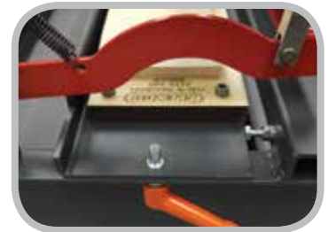
Easy positioning and clamping

240 Macpherson Road • #02-01 • Singapore 348574 Tel: +65-6484-1533 • Fax: +65-6484-1531 • E-mail: asiasales@flexco.com