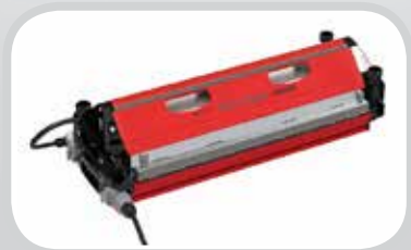
Novitool® Belt Fabrication Tools