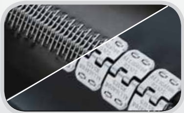
Clipper® and Alligator® Belt Fastening Systems