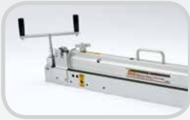
Flexco Belt Cutting Tools

The Flexco Laser Belt Square can be used in conjunction with many Flexco products, including: