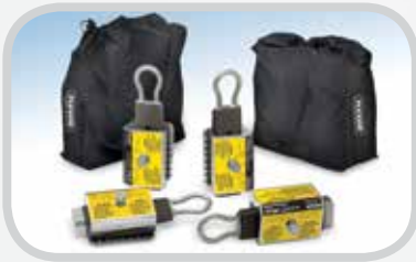
Smart Clamp™ Light-Duty Belt Clamps