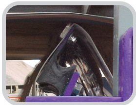
Durable tungsten carbide tips

Versatile tensioner kit can be mounted to push-up or pull-up the cleaner