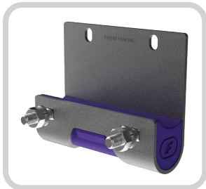
Optional stainless steel P Flextreme™ Cushions (PXTC)

Segmented blades ensure proper wear throughout the life of the blade