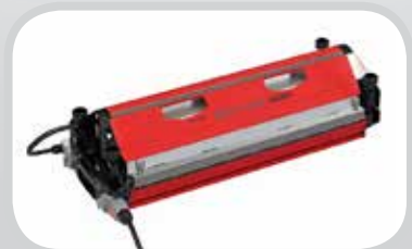
Novitool® Belt Fabrication Tools