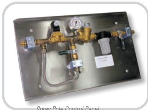
Spray Pole Control Panel

An optional Water Control Manifold is also available to maintain the correct spray pressure and water flow. It is complete with a strainer to minimize clogging of the nozzles, a pressure regulator that can be set to the recommended water pressure, a solenoid and bypass for maintenance, and a pressure gauge to visually check the pressure during routine inspections—all mounted on a stainless steel backing plate.