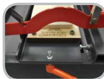
Easy positioning and clamping