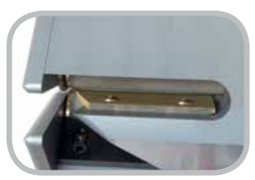
Solid fixture of blade