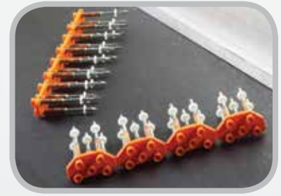
Rapid Loader™ Collated Rivet Strips with washers