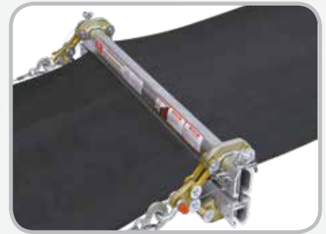
Far-Pul™ HD® Belt Clamp