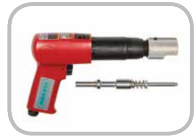
Air Powered Rivet Driver

*Includes Air Powered Rivet Driver, Retaining Spring, and Drive Rod with Hold Down Spring and Washer.