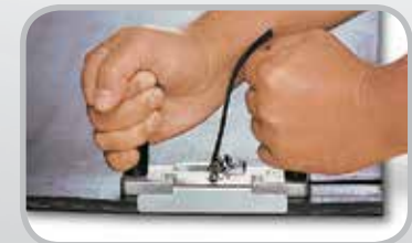
Flexco® Belt Groover

When the belt grip is slipped over the belt edge at a right angle, belts can be pulled without damaging the belt surface.