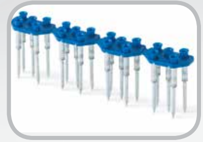
Rapid Loader™ Collated Rivet Strips