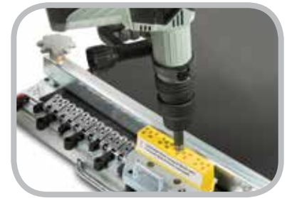
Electric Powered Rivet Driver Installation