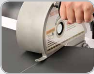
Electric Belt Cutter