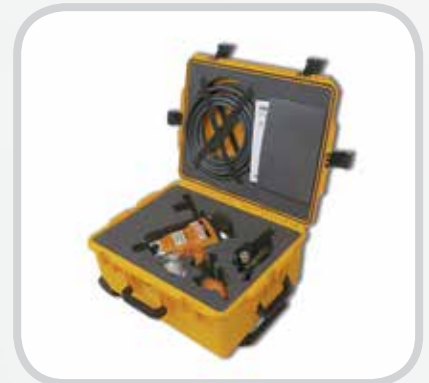
The Pneumatic Single Rivet Driver is protected by a portable carrying case