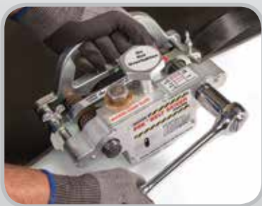
FSK™ Belt Skiver with metal fence