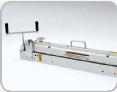
900 Series* Belt Cutter