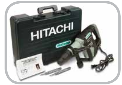
Electric Powered Rivet Driver

**For use with previous model: EPRDVSK-1.