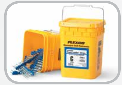
Conveniently packed, easy-to-use