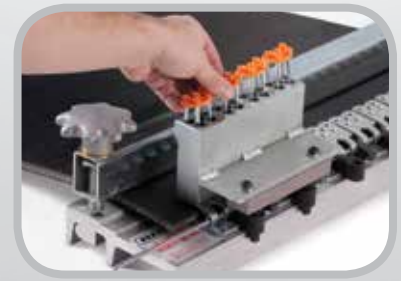
Speed Installation Time