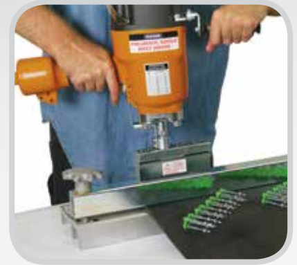
Consistent, long-lasting splice every time