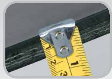
Measure belt thickness