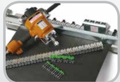
Select installation method