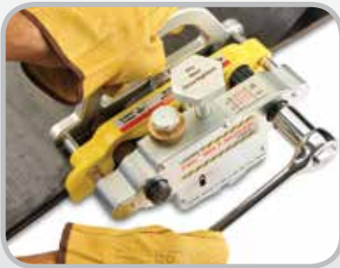
FSK™ Belt Skiver