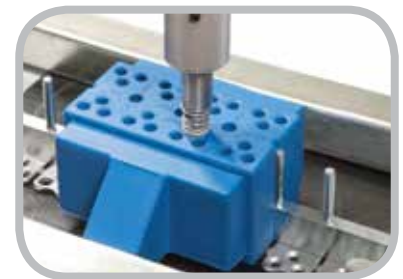
Air Powered Rivet Driver Installation

The heavy-duty tool allows for more compression of fastener plates resulting in a smooth and consistent splice that is compatible with conveyor components.