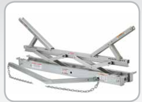
Flex-Lifter™ Belt Lifter