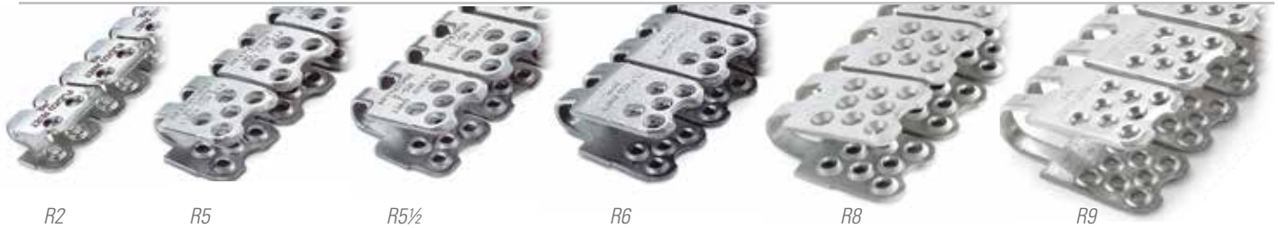
Flexco® Rivet Hinged Fastener Selection Chart

Use the charts below to match the Flexco® SR™ fastener to your needs. Find the fastener metal type required for your application. Then choose the ordering number that corresponds to your belt's width from the charts on the following pages.