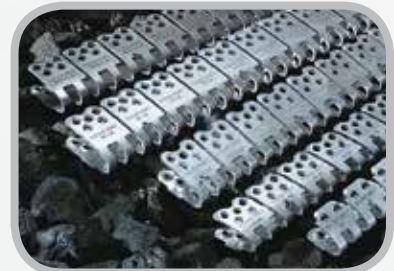
Select fastener size