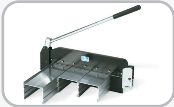
14" Belt Cutter