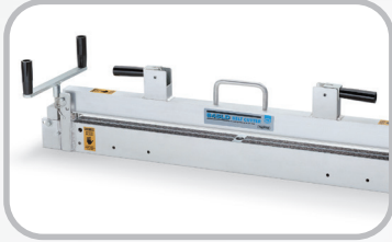
845LD Belt Cutter