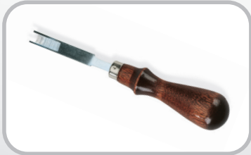
Rough Top Belt Skiver