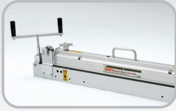
900 Series Belt Cutter