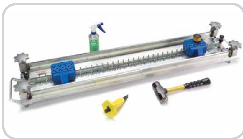
MBRT6 Tool Shown

Newly redesigned multiple rivet driving tools allow for faster, easier installation of BR6 and BR10 fasteners. The aluminum MBRT tools hold the belt, fastener strip, and guide blocks securely in place. Using the drive rod, simultaneously drive and set rivets for a smooth, low profile splice. The Aluminum MBRT Applicator includes two Multiple Guide Blocks, Multiple Drive Rod, 4 lb. Hammer, Bridge Removal Tool, and Lubricant.