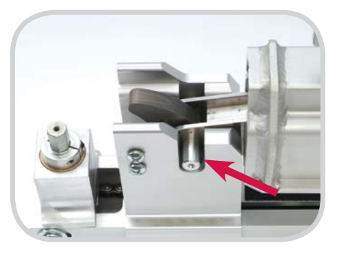
Allow the clamp beam to drop into position