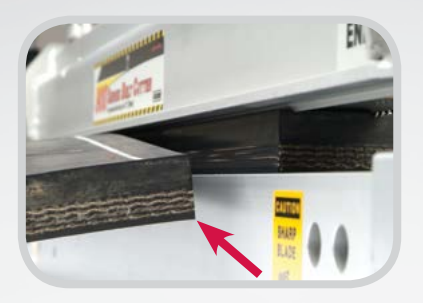
The single-sided clamp feature allows the cut belt to fall free on one side, eliminating the need for the blade to cut through two clamped surfaces, reducing operator effort.