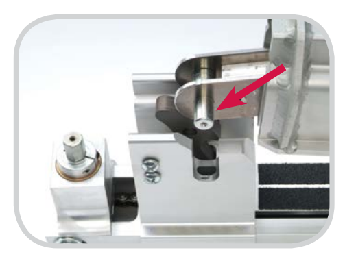
Align the clamp beam in the uprights

The top clamp beam can be removed quickly by simply depressing the quick release latch. Installing the top clamp beam is even easier – just align the clamp beam in the uprights and allow the beam to drop into position. Final clamping pressure is achieved with a few turns of the pivoting arm Acme threaded screw system for complete engagement of the clamp.