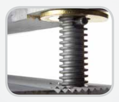
Heavier duty clamping methods with Acme threading to speed clamping time and ensure maximum holding ability even on thick, high tension belting.