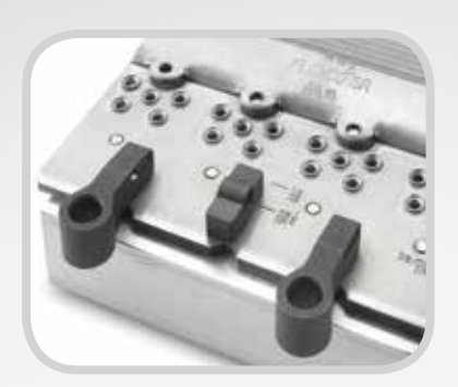
Specially machined Scalloped Edge™ on riser plate allows fasteners to nest securely for accurate alignment of fasteners.