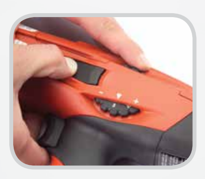
Easily adjust the Hilti DX 460-SR to the correct power setting for the rivet size and belt type for your installation.