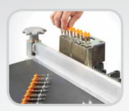
Requires only a standard Flexco® MSRT installation tool, a steel guide block assembly, and Rapid Loader™ Collated Rivets with Washers.