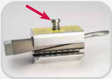
Return Spring Post holds wedges up so belt can easily slide into clamping position.