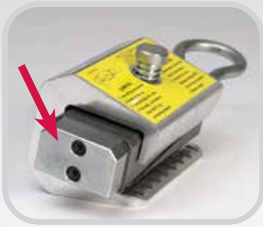
Large impact plate provides easy striking surface.