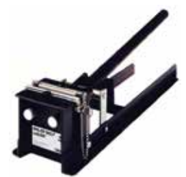
Baler Belt Lacer