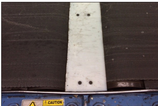
Homemade UHMW Transfer Plate

The solutions available to the above-mentioned issues have been limited, with maintenance personnel often having to resort to homemade devices made from ultra-high molecular weight (UHMW) polyurethane. However, there are serious implications involved with this practice.