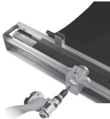
Roller Lacer® Gold Class™