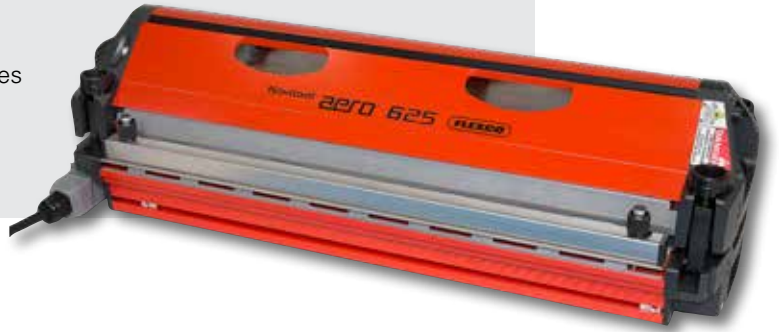
Aero® Voltage Compatibility