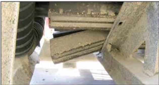
Knowing the material lump weight and drop height are essential to choosing proper impact point protection. If these numbers aren't taken into account, the impact bed will fail, as seen here.

In many cases, there is not enough support for the belt in that area. Some common examples of this problem include not using impact idlers or beds; spacing impact idlers apart, which creates gaps in the seal that can cause spillage; catenary idlers that have too much "give," which can cause belt damage and spillage; and mistracking caused by off-center loading at the impact point.