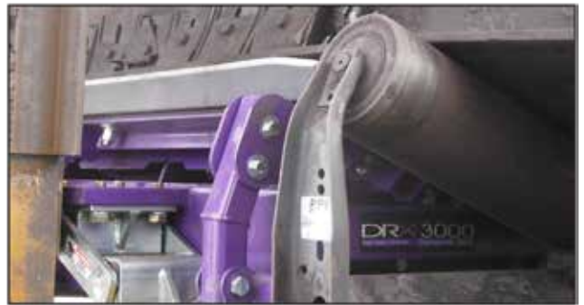
In some cases impact idlers are enough, while others may need a true impact bed to provide the required protection for the belt.

Keeping these issues in mind, you want to make sure the belt is continuously supported. A proper impact bed can be the solution to all of these challenges, but you'll need to make sure you have all of your specifications correct. Knowing the largest material lump weight and drop height are essential to choosing the proper bed. When these numbers are multiplied together it will provide the impact force for your application. Once you have this information, make sure that your solution's ratings are never lower than your calculated impact force.