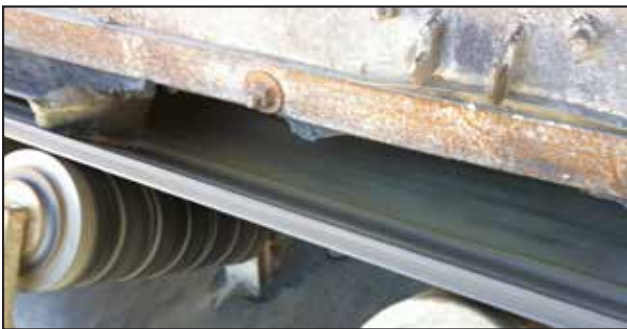
One of the most important jobs of the load point is to provide a seal that prevents material spillage and controls dust. In this photo, spillage and dust are likely because a proper seal is not attained.

While idlers are often used, belt sag is a common problem. The use of idlers can create air gaps between the belt and the skirting, allowing material to escape. This often makes sealing the load quite difficult and should not be solved by placing the idlers next to each other. The practice of putting idlers in close proximity to prevent sagging is impractical from a maintenance standpoint because access to the rolls for replacement is nearly impossible, especially with a skirt wall above the belt.