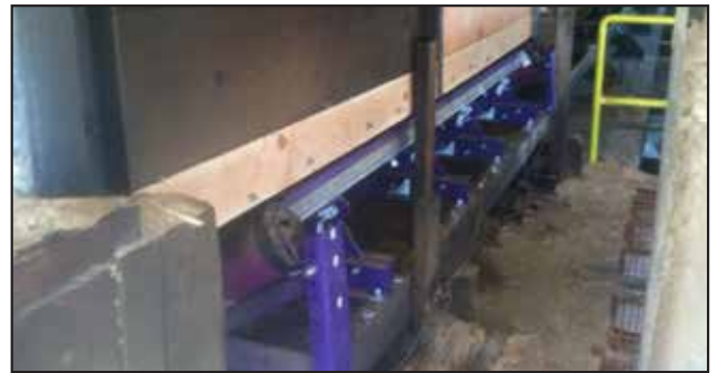
To seal the load zone properly, the clamping mechanism should be both durable and provide a strong hold. Paired with a belt support system that provides an even and consistent surface, a proper seal is achieved.

One of the most important jobs of the load point is to provide a seal that prevents material spillage and controls dust. The clamping mechanism should be both durable and provide a strong hold that discourages vibration and drag on the skirt rubber. It should also be easy to service the skirt clamp by providing a simple release mechanism on the clamp. A simple process to loosen the clamp allows for quick adjustment when the skirting material wears or skirting needs to be replaced. If the process is more complicated than this, maintenance may take too long or it may not be done at all.