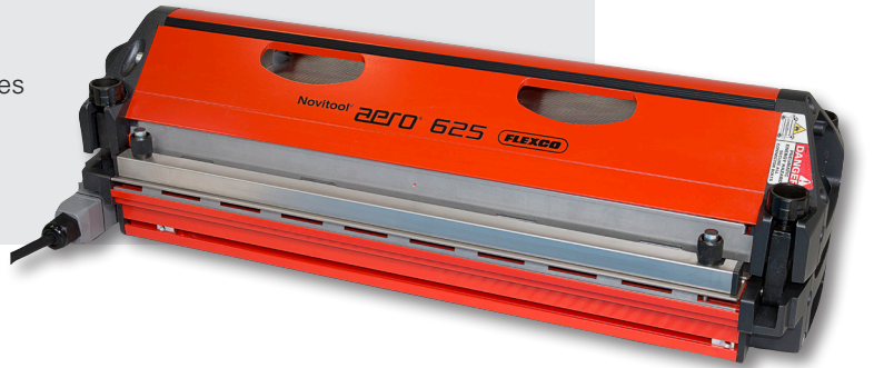
Aero® Voltage Compatibility