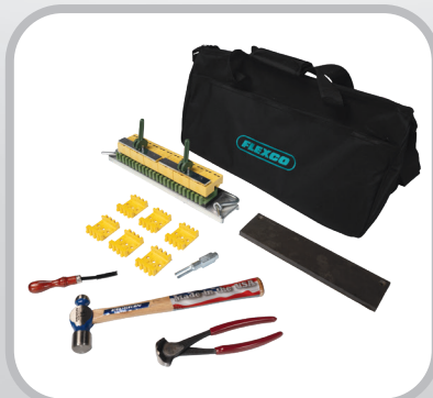
Full Tool Kit