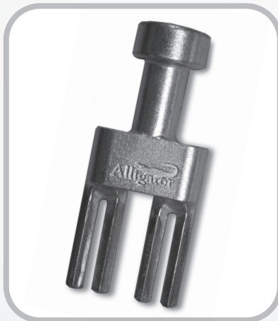
Quad Staple Driver