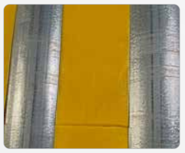
Covers the gap: Specially designed for 1.9" diameter roller conveyors with 3" centers.