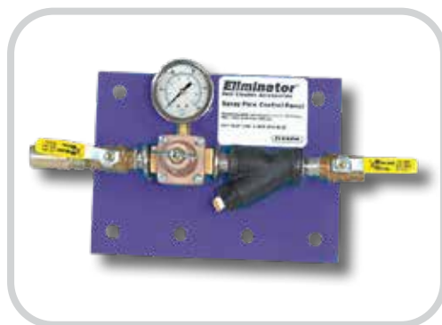
Spray Pole Control Panel