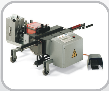
Shown: AMU 6000

Includes all Pro 6000 features except the heated jaws.