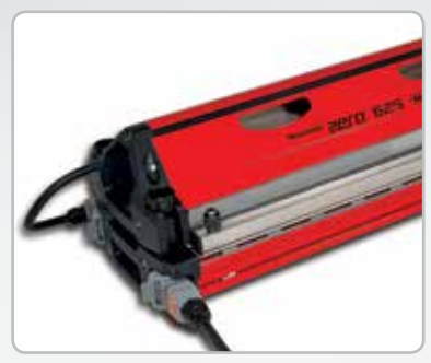
Aero<sup>®</sup> Press: An innovative, air-cooled press that does not require external components. Complete cycle time is approximately 10 minutes, significantly increasing belt productivity.