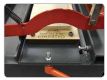
Easy positioning and clamping

Flexco (Aust.) Pty. Ltd • 10 Solent Circuit, Norwest • NSW, Australia, 2153 • Australia Tel: 612-8818-2000 • Fax: 612-8824-6333 • E-mail: salesau@flexco.com