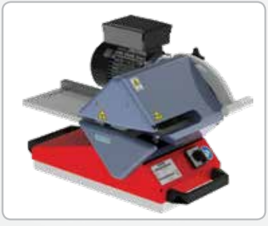
Ply 130<sup>™</sup> Ply Separator: The robust design allows for quick, effortless, and precise ply separation on thermoplastic belts even extremely thin or difficult belts.