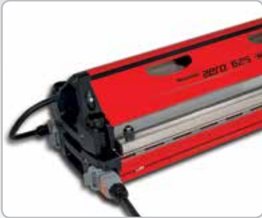
Aero® Press: An innovative, air-cooled press that does not require external components. Complete cycle time is approximately 10 minutes, significantly increasing belt productivity.