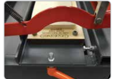
Easy positioning and clamping