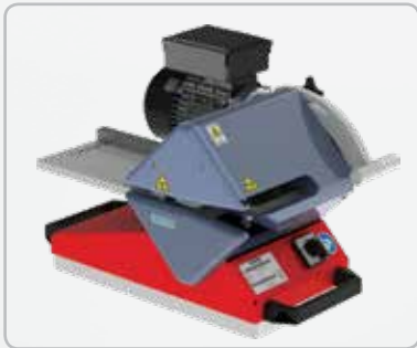
Ply 130° Ply Separator: The robust design allows for quick, effortless, and precise ply separation on thermoplastic belts - even extremely thin or difficult belts.