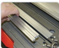
Interchangeable Splice Templates for precise pitch splicing of belts from various belt manufacturers