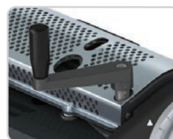
Shielded Heat Zone and Temperature Control ensures splice parameter consistency regardless of ambient temperatures