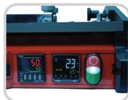
Digital Time Control with quick, simple splice settings; the Pre-Heat Setting

can be used to remove moisture and avoid pinholes