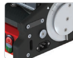
Operates on Single Phase 115V or 230V