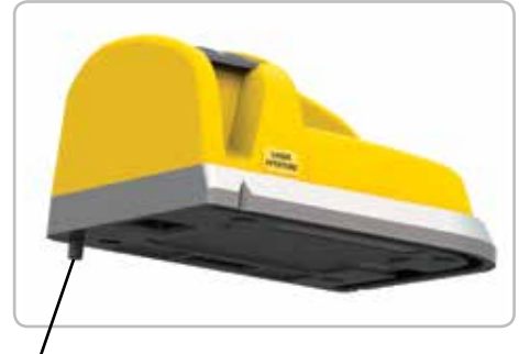
Spring-loaded belt edge locating pin extends below the belt surface to help properly align the laser with the edge of the belt.