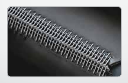
Anker® Wire Hook Fastening System