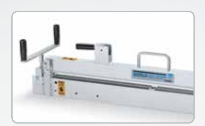
845LD Belt Cutter

The Flexco Laser Belt Square can be used in conjunction with these Flexco products to keep belts up and running at peak performance.