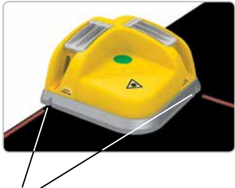
Lasers are conveniently located close to the edge of the unit for use in tight areas and for belts with side pans.