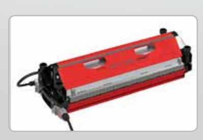
Novitool® Aero® Splice Press