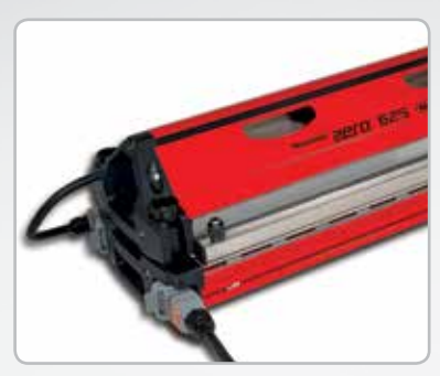
Aero® Press: An innovative, air-cooled press that does not require external components. Complete cycle time is approximately 10 minutes, significantly increasing belt productivity.