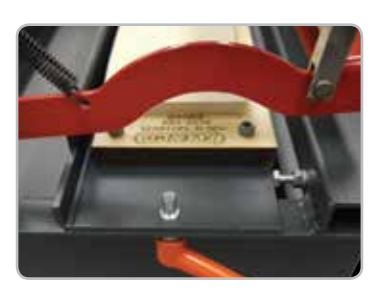
Easy positioning and clamping