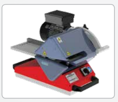
Ply 130™ Ply Separator: The robust design allows for quick, effortless, and precise ply separation on thermoplastic belts even extremely thin or difficult belts.