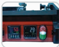
Digital Time Control with quick, simple splice settings; the Pre-Heat Setting

can be used to remove moisture and avoid pinholes