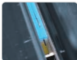
Integrated Belt Cutter maintains accurate pitch in a single pass

Custom templates secure the belt when cut to ensure accurate pitch control. Then the contactless heating process splices the belt in less than one minute and finishes with a controlled amount of clash. To ensure quality splices, pinholes are avoided through engineered solutions such as the pre-heat function to remove moisture from the belt ends; the shielded heat zone for consistent heating in various environmental conditions; and the contactless heating method. Accuracy, speed, and operator safety are fully integrated into the Amigo design, making it an ideal splicing tool for in-shop or on-site splicing.