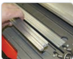
Interchangeable Splice Templates for precise pitch splicing of belts from various belt manufacturers