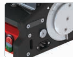
Operates on Single Phase 115V or 230V