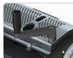
Shielded Heat Zone and Temperature Control ensures splice parameter consistency regardless of ambient temperatures