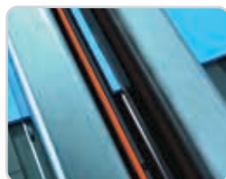
Contactless Heating provides for a controlled amount of clash without actual contact with the heat source