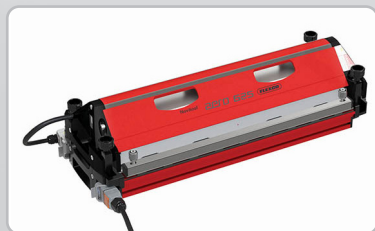
Novitool® Belt Fabrication Tools