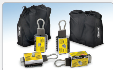
Smart Clamp™ Belt Clamps

Use the 845LD Belt Cutter in conjunction with these Flexco products to keep belts up and running at peak performance.