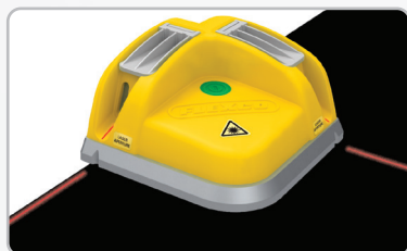
Laser Belt Square