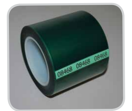
Patent number: US 9,090,022 B1