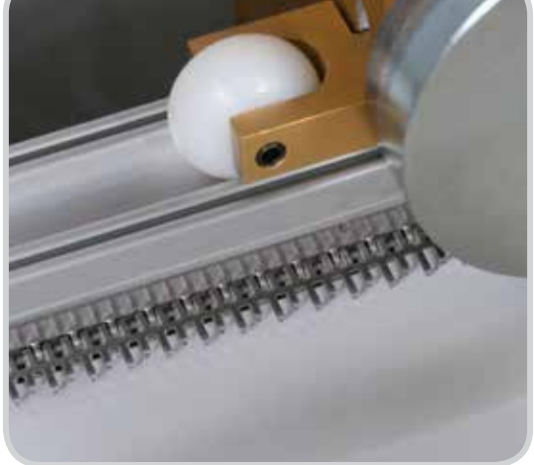
Flat, Low-Profile Splice is ideal for applications with slider beds