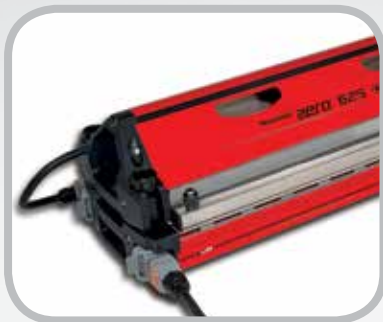
Aero® Press: An innovative, air-cooled press that does not require external components. Complete cycle time is approximately 10 minutes, significantly increasing belt productivity.