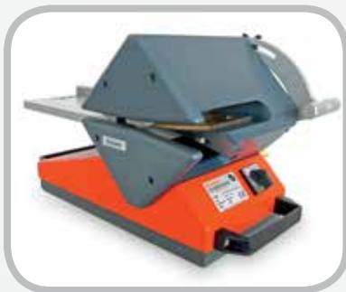
Ply 130™ Ply Separator: The robust design allows for quick, effortless, and precise ply separation on thermoplastic belts - even extremely thin or difficult belts.