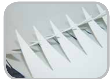
Punches precise fingers