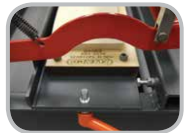
Easy positioning and clamping